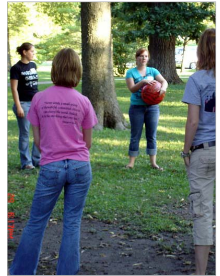
Catt Associates, ACT members and Learning to Lead members play a get-to-know-you game at the school year kick-off barbeque.

In 2006-2007, the Catt Center is offering a new learning community, Learning to Lead (LTL). The learning community is linked to two courses that are part of the Joni and John Axel Leadership Development Series of seminars. Students take one course together in