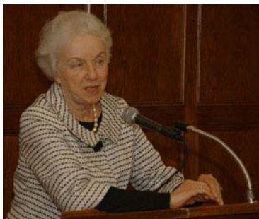
Kunin speaks at Iowa State on April 24.

Speaking candidly about the role of women in politics, Kunin reiterated that